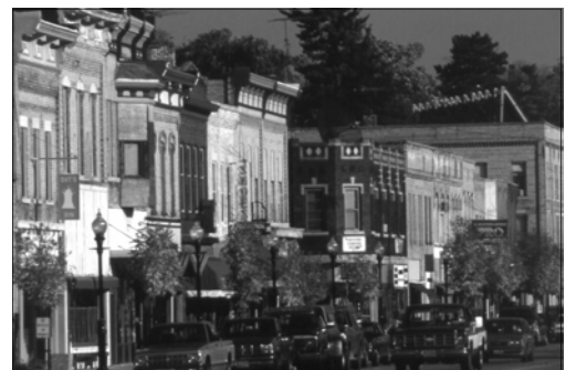
Downtown Edgerton