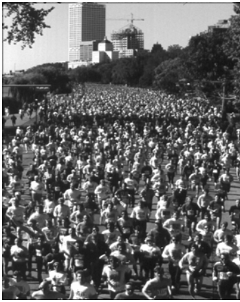
Al's Run by Henry H. Smith

My entire family has taken up residence in a depression-era office building downtown and now roam the gray halls, sleeping on wool couches, dreaming in low fog off the great lake. Now they speak to each other through an elaborate network of pneumatic tubes hidden behind the walls. Finally a place to catalog the ghosts, handwritten lists, and a congress of stuffed chairs. The most fragile inheritance: a thousand mirrored windows, my small reflection in each. Tonight I approach the city through an interchange of horn blast and brake light, the sun draining pink over coal barges and mountains of salt. The air thickly sweet with hops and chocolate. In the distance, the first silhouettes are already waving.