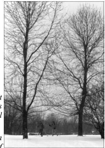
Cross-country skiers

Please come to the first reading of “In My Neighborhood, Celebrating Wisconsin Cities” on Tuesday, December 12, 2000 at 7:30 p.m. at Canterbury Booksellers (315 West Gorham St., Madison, 258-9911). Meet the contributing authors and poets from the Madison area, have your books signed and join us for a discussion about the important role Wisconsin's cities play.